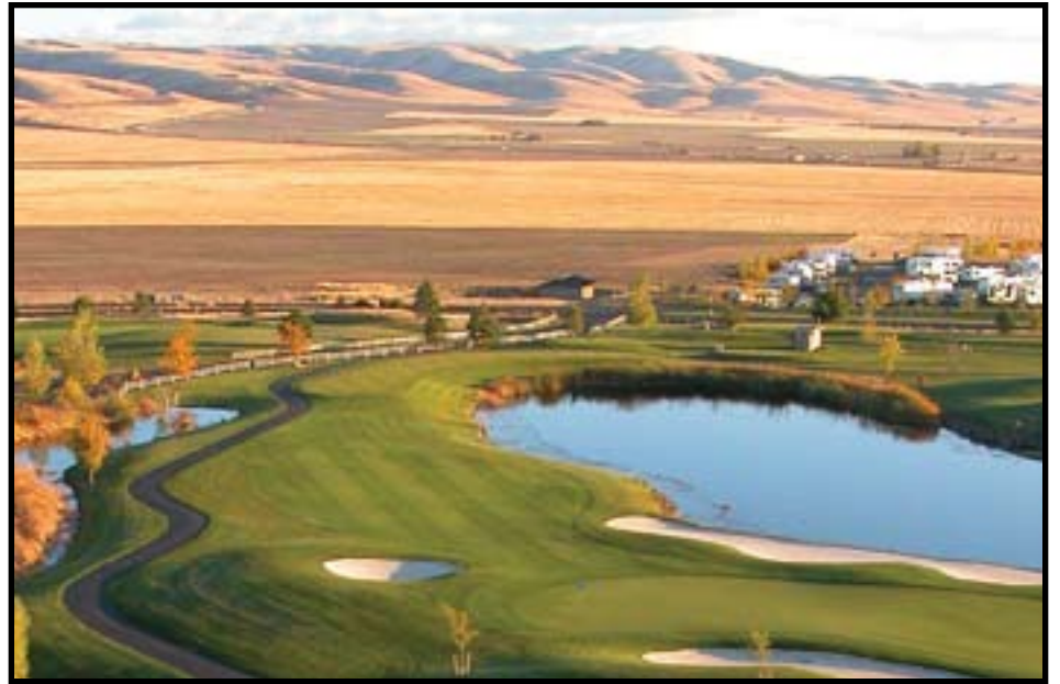
Wildhorse Resort and Casino offers 100 spots for RV travelers in Pendleton, Ore.

• Sage Hills: This Central Washington Golf and RV Resort had 42 premium RV spots next to its 18-hole course. New operator Chad Niedermeier is making upgrades to the facility, making it an even bigger attraction for RV golfers. Sage Hills in Warden, Wash. is located just a few minutes south of Moses Lake.