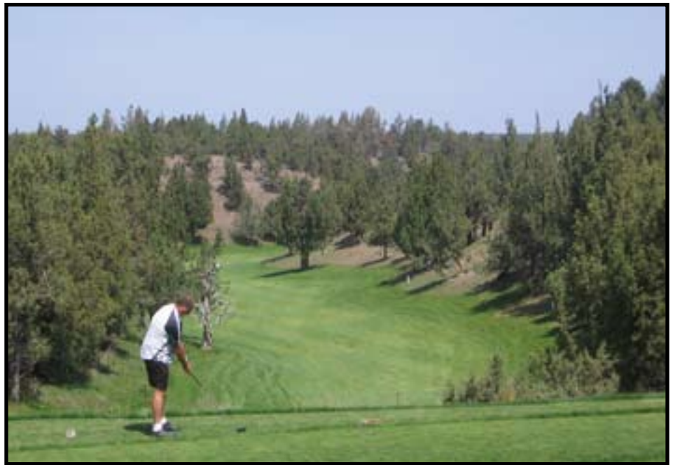
The tee shot on No.2 at Eagle Crest's Resort course is a downhill challenge.

• The Resort Course – Host of the 2011 Pacific Amateur and Oregon High School State Golf Championships since 1991.