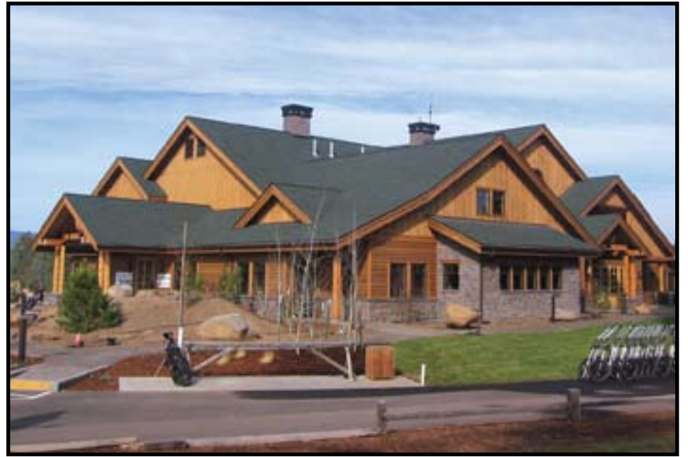
Aspen Lakes in Sisters recently opened a new rustic-looking clubhouse.

Ponderosa pines, scented juniper trees, pristine lakes and breathtaking views of the Cascade Mountains at almost every turn make Aspen Lakes an amazing all around golf experience. It's no wonder it is a popular place for families and as well as corporate outings. A new rustic clubhouse adds to the golfing experience.