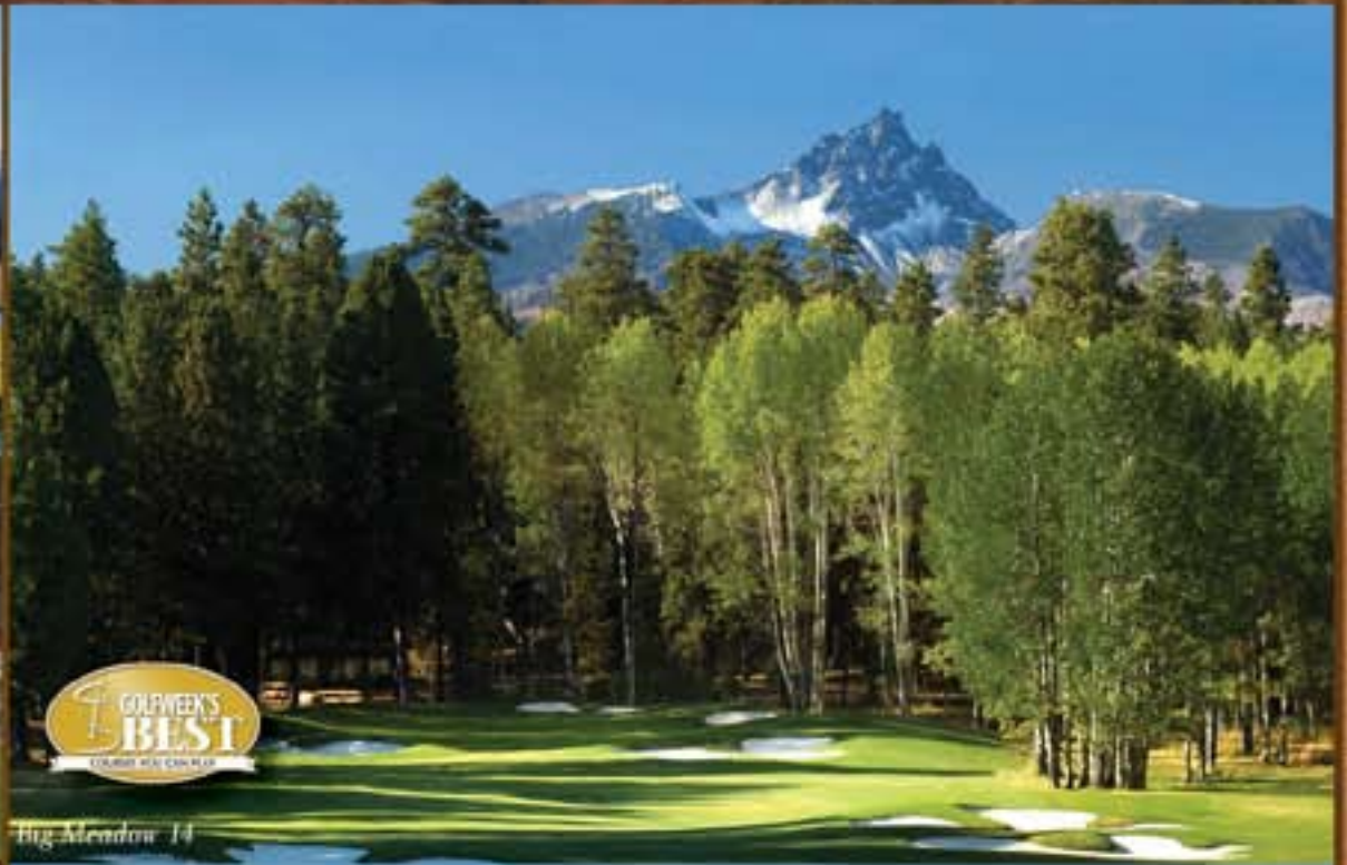
Big Meadow 14