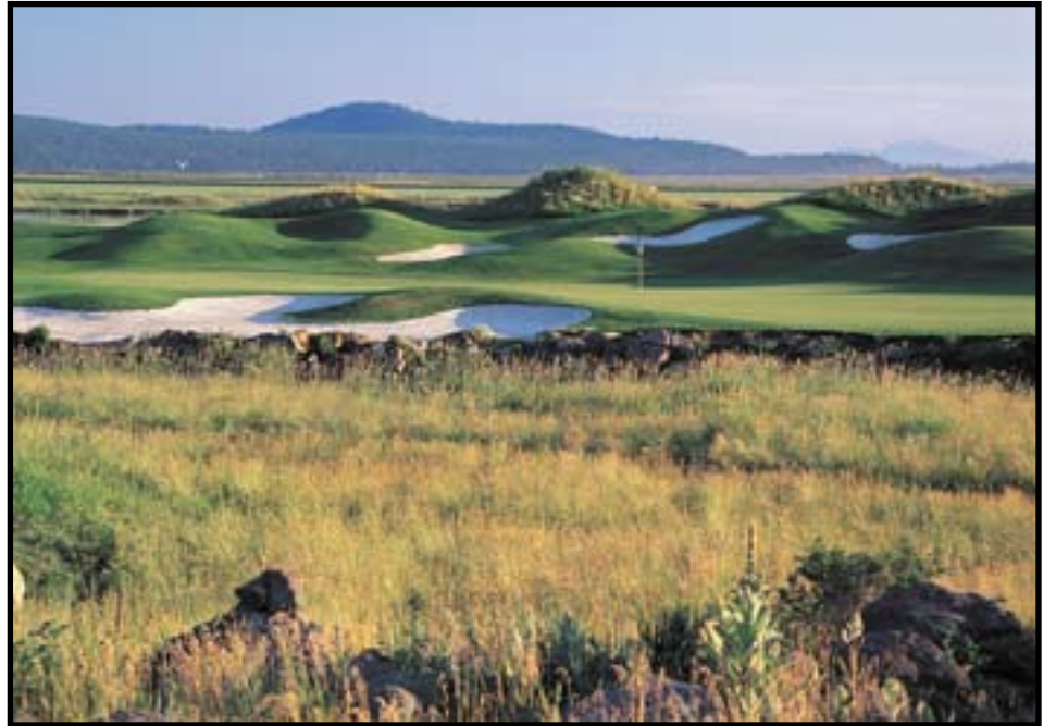
The Running Y Ranch in Klamath Falls is an Arnold Palmer designed golf course.