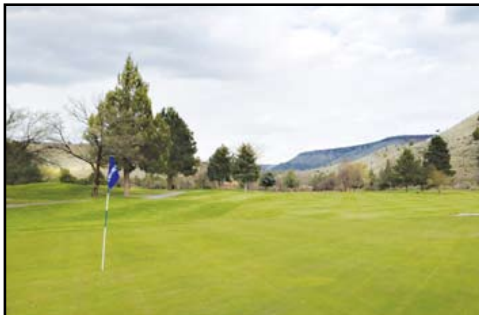
Kah-Nee-Ta meanders along the Deschutes river with some memorable views.

Today, Meadow Lakes is an environmentally friendly golf course that presents a links-style layout with several water hazards to keep you focused. One of those hazards comes into play on the very first hole, a par-5 dogleg right.