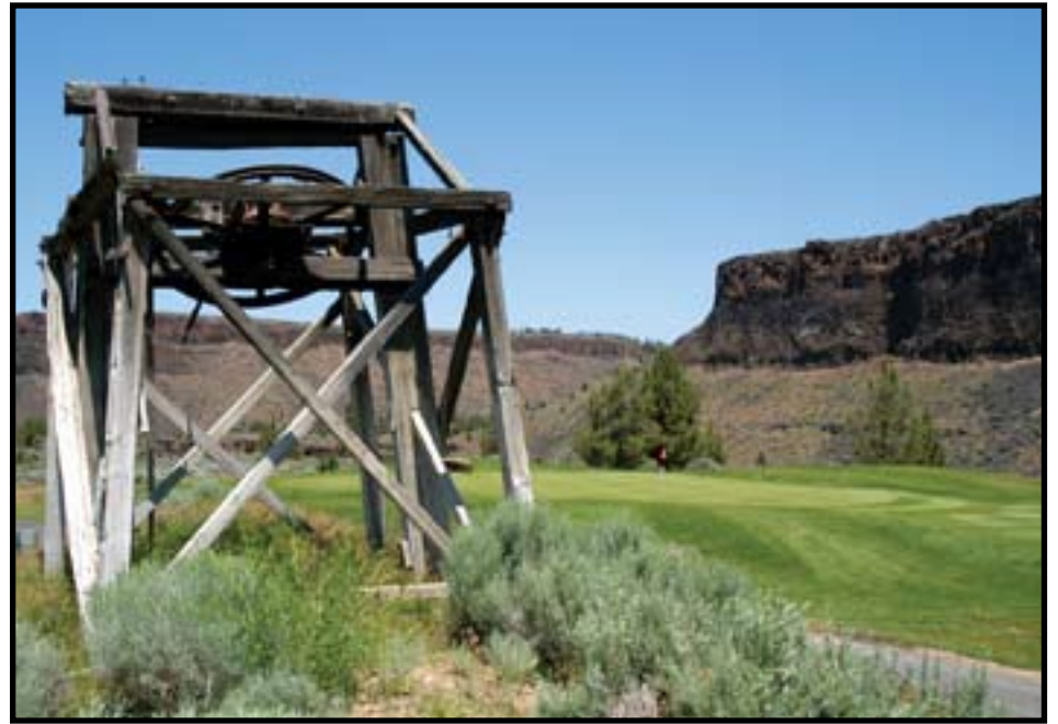
At Crooked River Ranch the course winds through some spectacular scenery.

The new Juniper plays to over 7,100 yards from the tips with views of Mt. Bachelor, Broken Top, the Three Sisters, Mt. Washington, Three-fingered Jack, Mt. Jefferson and Mt. Hood. Golf Digest took notice of the new course, naming Juniper as one of