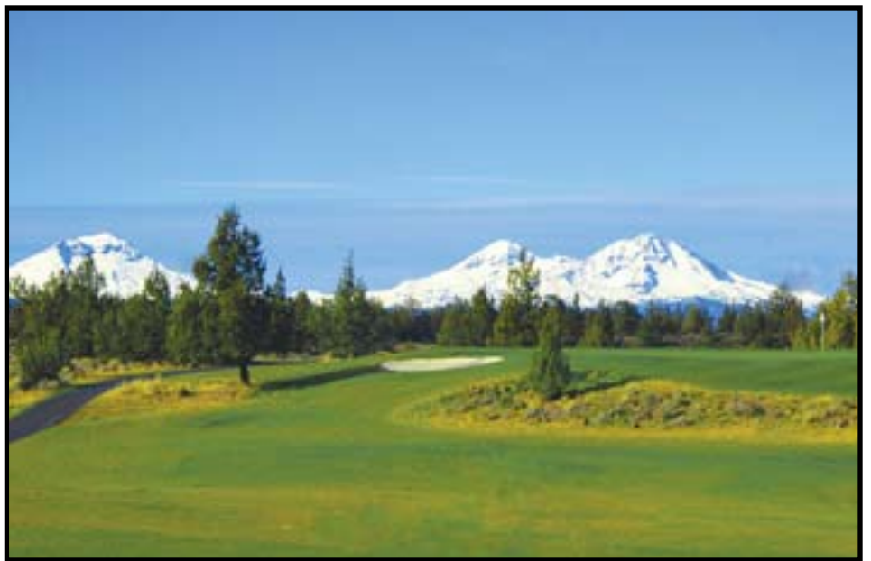
A new Juniper course opened seven years ago in Redmond and is still a hit.