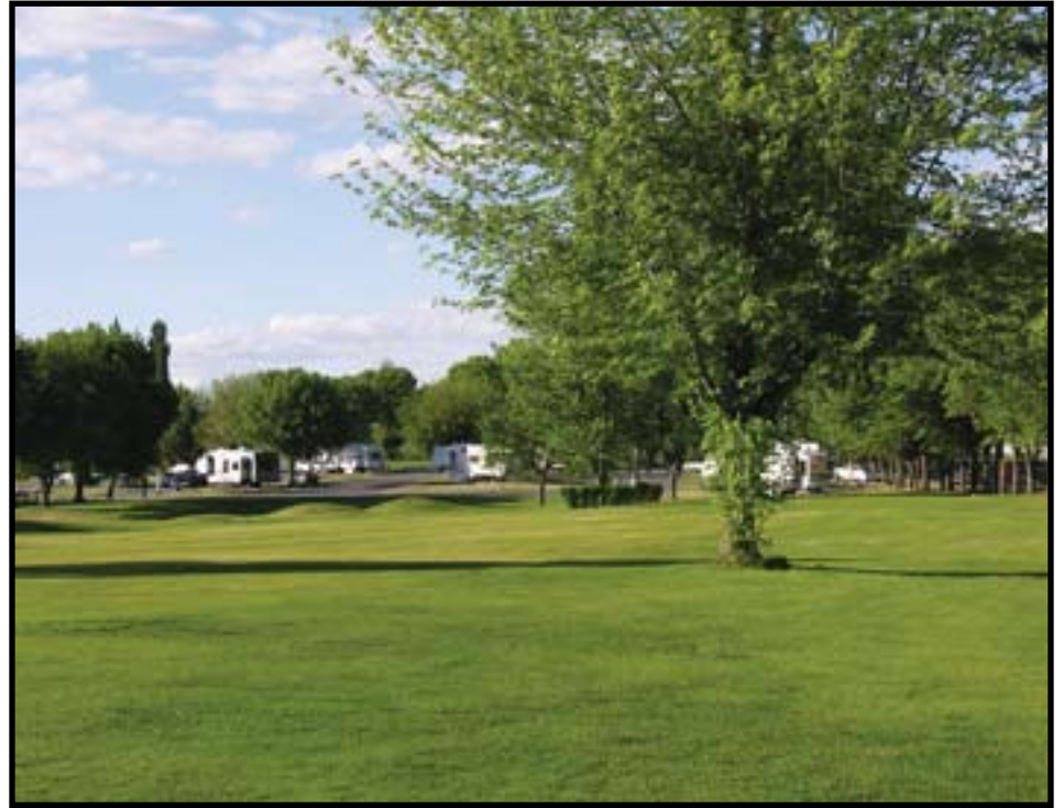
Sage Hills offers up a perfect place near I-90 for golfers traveling with RV's.

These days, RV parks are becoming even more user-friendly, with cable or satellite television hookups, shower and laundry facilities, restaurants and more – Mallard Creek in Lebanon, Ore. has a real upscale landscaped park adjacent to the golf