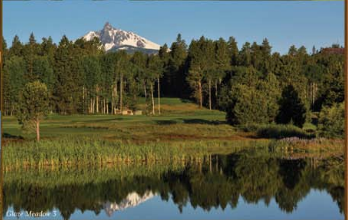
Glaze Meadow 3

Play 18 holes of golf at Big Meadow golf course or Glaze Meadow course, anytime Sunday through Thursday after 11am, and enjoy a menu item from the all-day menu at Robert's Pub for only $59.