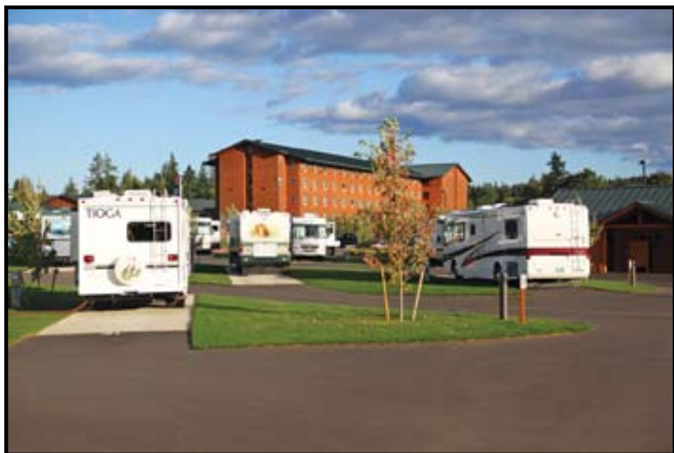
The Little Creek Casino Resort in Shelton offers 44 full hook ups for RV's.