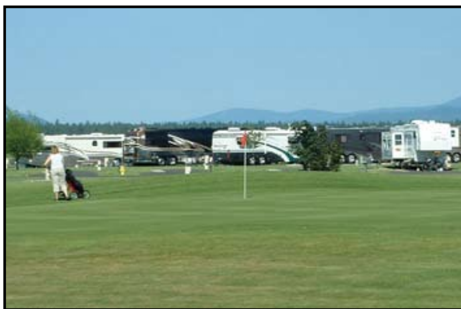
Deer Park's RV park has proven to be a popular place for people from around the country.

The RV resort charges $33 per night, $195 per week and $645 per month from June through August. For more info, see spokanervresort.com