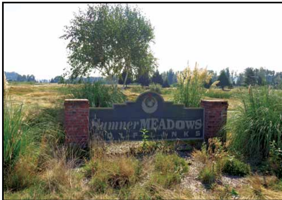
The sign to the old Sumner Meadows course shows how overgrown it has become since closing.