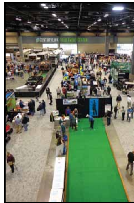
The Seattle Golf Show is set for March 4-6.

• Seattle Golf and Travel Show: Set for March 4-6 at the CenturyLink Field Events Center. Tickets are $15.34. For more information see www.seattlegolfshow.com .