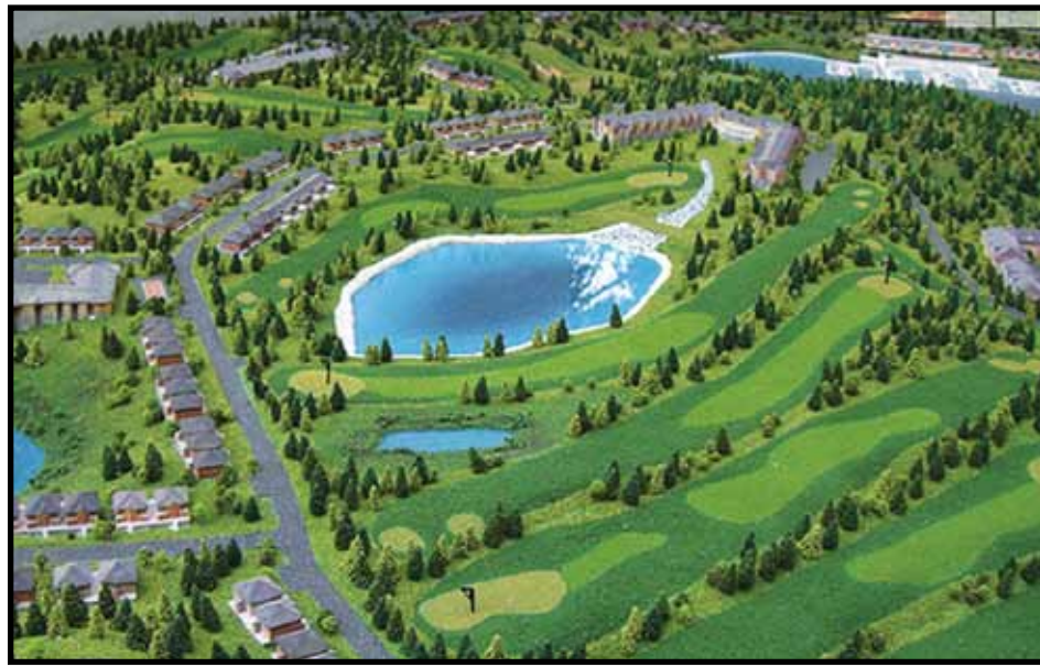
The proposed Pleasant Harbor Marina and Golf Resort on the Olympic Peninsula has downsized.

Either way, the hopes of another golf resort in the Puget Sound region have pretty much faded away.