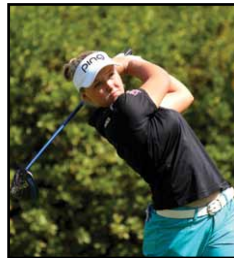
Brooke Henderson won the event in 2015.

The Portland Classic Presented by Cambia will be the second of two LPGA events in the Northwest in 2016. The KPMG Women's PGA is set for Sahalee June 9-12.